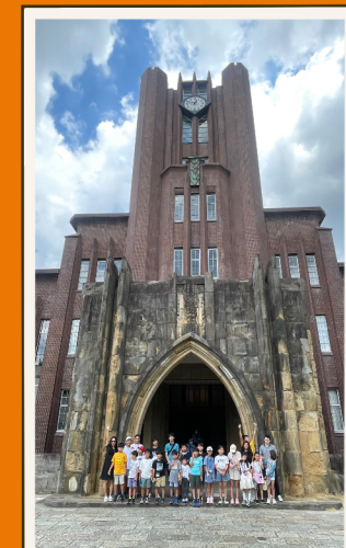
SUMMER CAMP 2023

Tuition (tax excl.) for each 5 day course: ¥87,000