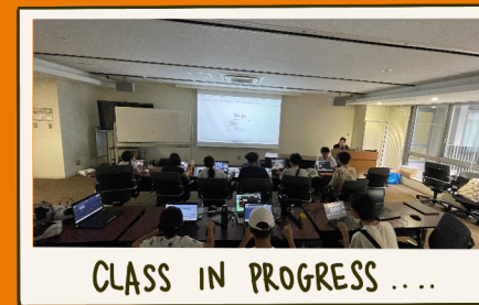
CLASS IN PROGRESS ...